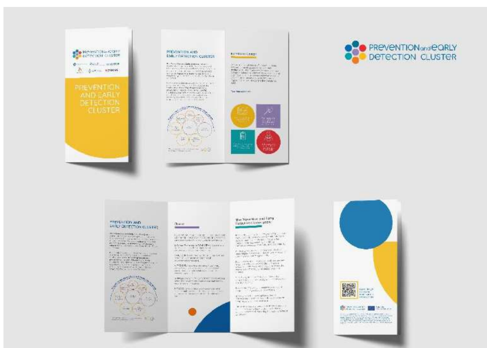
Figure 1. Cluster brochure

The brochure (see Annex) has been produced to serve as a complementary resource for distribution at events or local occasions, whether organised by the Cluster, its projects or participating partners. Written in accessible language and produced with an eye-catching design, this communication material includes an introduction to the main objectives of the cluster, an overview of the six participating projects and their cross-cutting areas. It also includes a QR code directing people to each project's website for more information, and both the cluster logo and the logos of the six projects are displayed on the brochure.